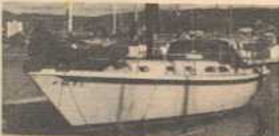
ERICSON 35 LIMITED EDITION. 1980 with many extras. Reduced price $59,000.

1070 Marina Village Parkway Alameda, California 94501 (415) 521-5636