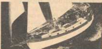
HANS CHRISTIAN 36 MARK III. 1984 Dealer Demo. Incredible price! Ask us!

EXCLUSIVE Dealers for Hans Christian Yachts in Northern California, Nevada & Utah