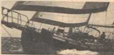
HANS CHRISTIAN 43T 1982 Cutter. Perfect liveboard. $139K/offer.