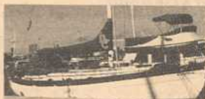
HANS CHRISTIAN 38T. Loaded for Cruising. Asking $105,000.